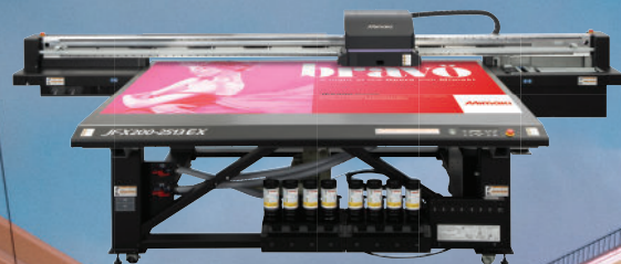
Mimaki JFX200-2513 EX